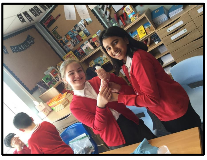
Super scientists. Extracting strawberry DNA in Year 6