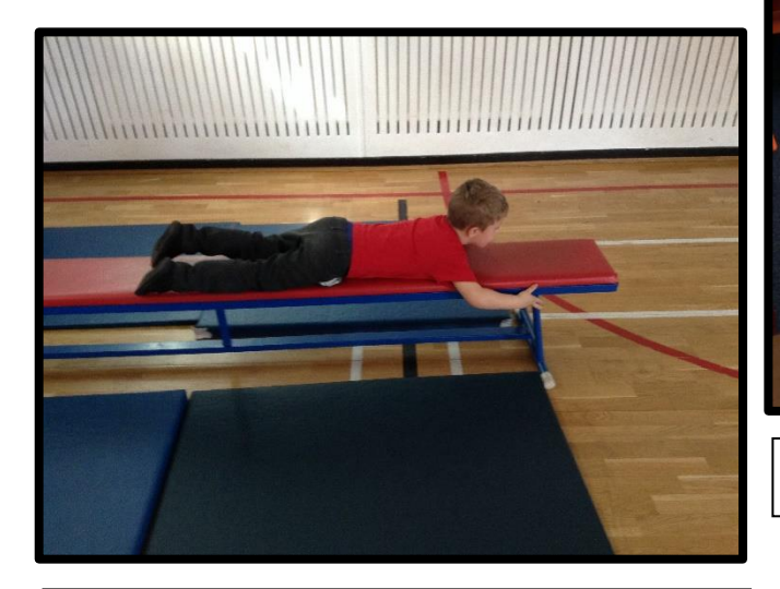
Above: Balance and body shapes in Reception. Right: Year 5 using Google Chromebooks for research and non-chronological reports.