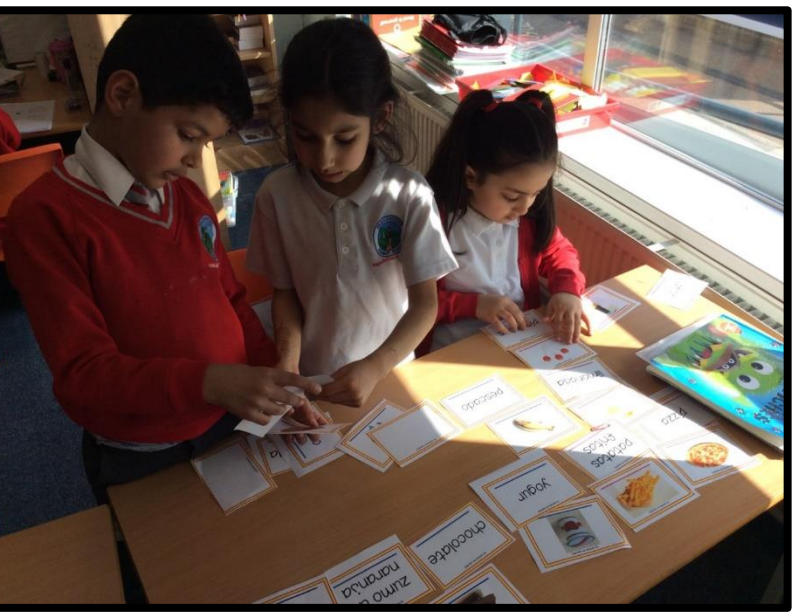
Spanish in Year 2!