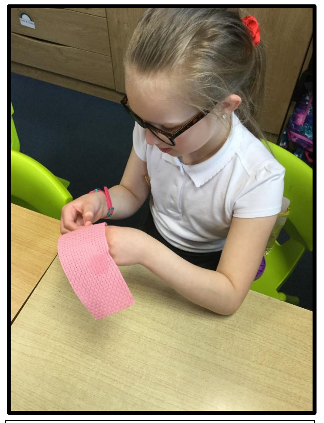
Practising backstitch in Year 3

Here is some of the learning from this week: