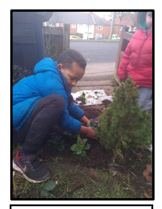
Great gardening skills!