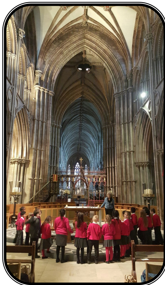
Year 3—Trip to Lichfield Cathedral. A great morning enjoyed by all.